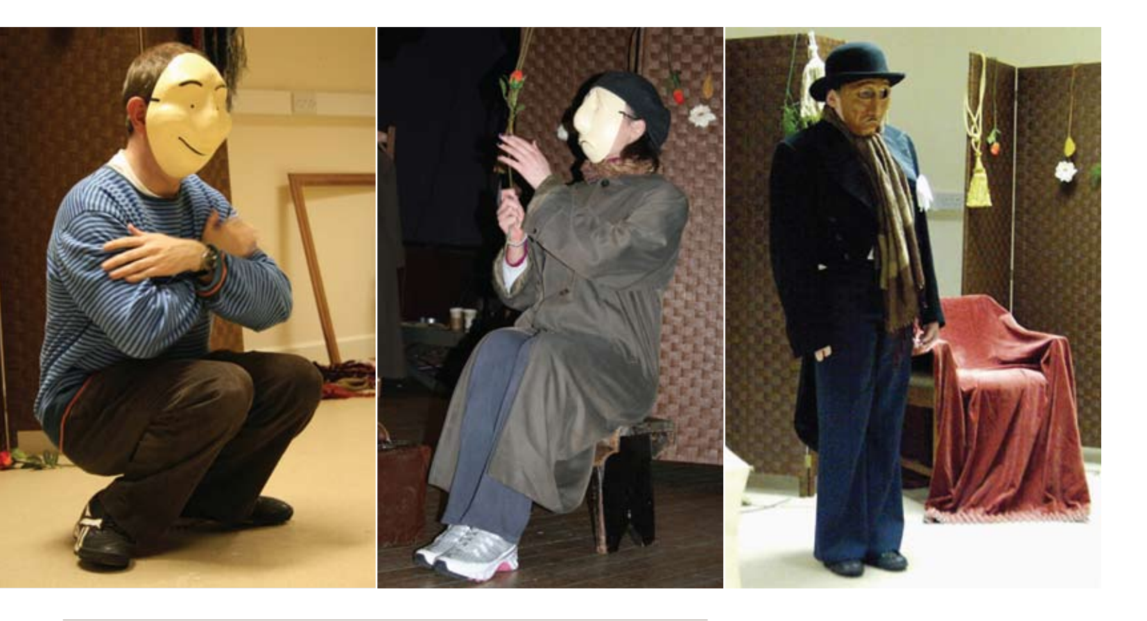
Members of Scannán film-makers' group participating in a Lawnmowers Independent Theatre Company workshop, Ballina, 2009